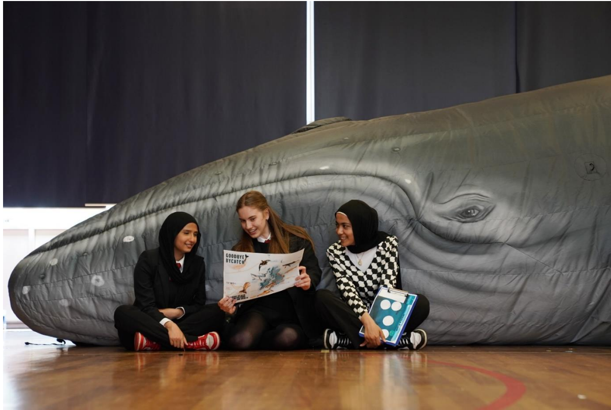
Hope the Humpback Whale